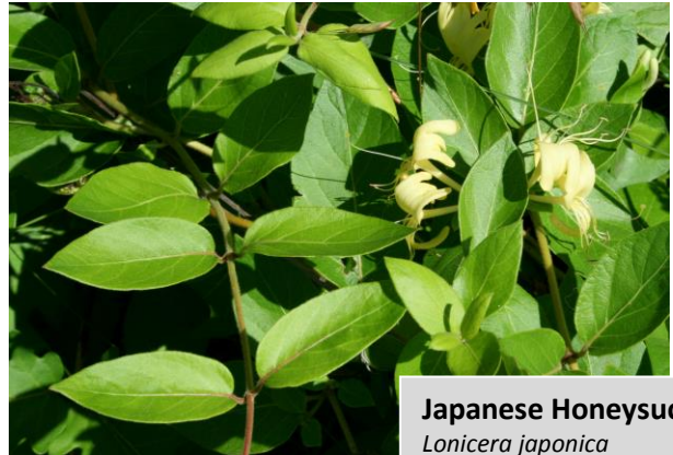
Japanese Honeysuckle Lonicera japonica