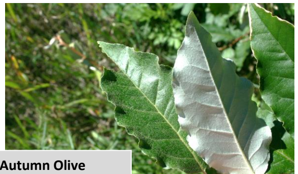
Autumn Olive Elaeagnus umbellata