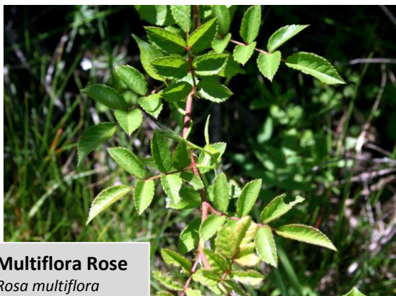
Multiflora Rose Rosa multiflora