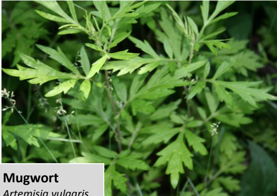
Mugwort Artemisia vulgaris

“A nonnative plant which through its prolific reproductive capacity interferes with a native or commercially significant habitat.”