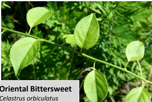
Oriental Bittersweet Celastrus orbiculatus